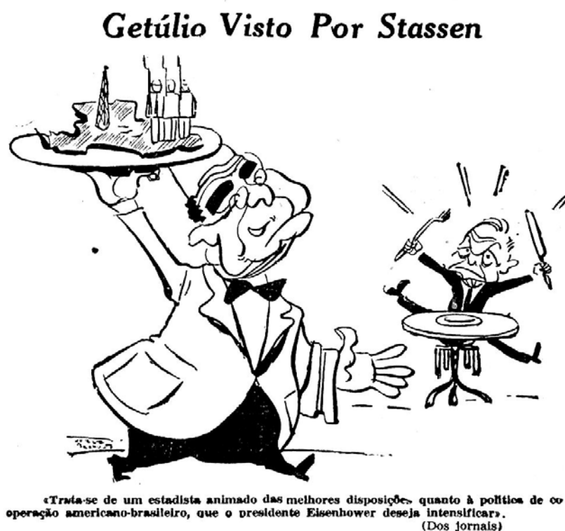
Figure 16: "Workers' Voice" January 23, 1954, p.3

Vargas is best characterized as a waiter in Workers' Voice, of 23 January 1954 (Figure 16) and on July 24, 1954, in the same paper, although with different subtitles. The American citizen is still eager waiting of national wealth, but here the characterization of Getulio as a waiter is more crafted, both in uniform and in cloth it brings, possibly to contain the salivation of the American man. The dish served is the Brazilian homeland, since the food takes the form of Brazil, while it stands out the oil, represented by the towers, and the Brazilian troops. The fat of the mighty was directly related to "eat" the Brazilian nation, its wealth and potential.