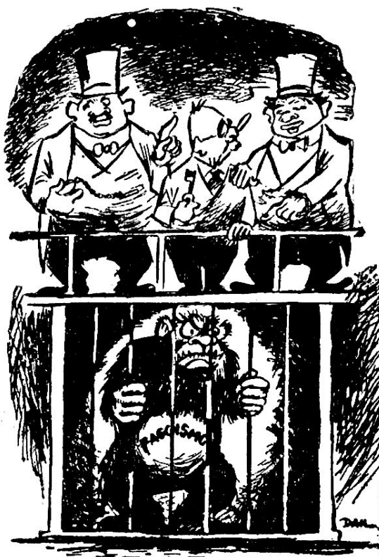
Figure 11: "Workers' Voice" March 1, 1952, p. 12.

directions while the other rests his hand on her shoulder, signaling control and superiority. Above the drawing, the headline says: "Plan of provocations and fascist terror".