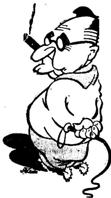
Figure 3: "Workers' Voice" January 12, 1951, p.9.

One of the recurring images of Vargas characterizes as a farmer, with a cigar, whip and spur, and repeated at various times unrelated to those of the same page. In "Workers' Voice", of 12 January 1951 (Figure 3), for example, he smokes a cigar, with his eyes that can not be seen, without showing us where he is looking to. According to García (1980, p.696), the whip "is to punish and exercise the horses," but the horse does not appear in the picture, which suggests that the whip here is used as a "symbol of power judiciary and its right to inflict punishment, "as quoted by Chevalier and Gheerbrant (2003, p.233). Vargas whip does not turn against horses, but rather against the workers, which shows his power of squire and explorer. He has in his hand the Judiciary, the prerogative of the State, may inflict punishment to the workers. The whip can also be a reference to the scourging in the slavery times.