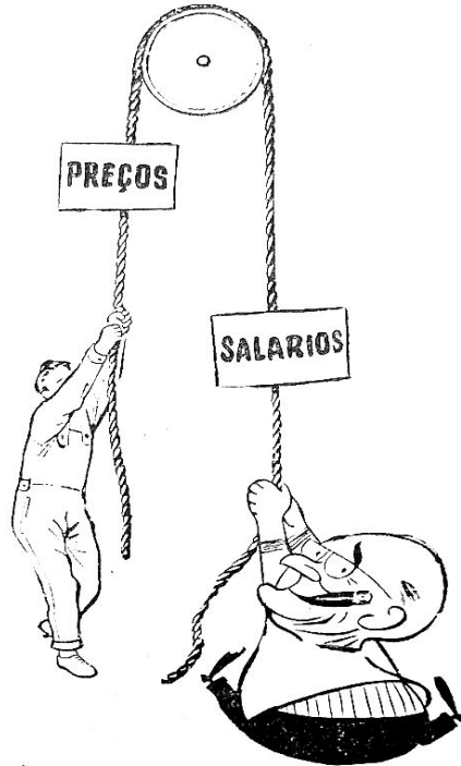
A política "trabalhista" de Getúlio: enquanto os trabalhadores lutam por aumento de salários, os tubarões são favorecidos com novos aumentos dos preços

sneaky look, to sharks and to the US President, Harry Truman, recipients of funds from the Brazilian workers.