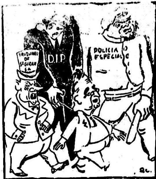
Figure 1: "Workers' Voice" of August 5, 1950, p. 11.

Communist press recreates what "he said" with another connotation, compared to what "he did". A Quirino Campofiorito drawing showing Getúlio's past in the "New State", formed by monsters - Court of National Security, Department of Press and Propaganda (DIP) and Special Police, all larger than Getulio and watching as henchmen (what the bureaucrat Justice lost in stature and brutality to his companions gained in ferocity). The drawing was published in Workers' Voice of August 5, 1950, with a caption on the "tyranny of bloodthirsty" Vargas, referring then to the exception of court, censorship and repression. Social legislation created by the dictator did not enter this representation, only the monsters, which reinforced and justified their authoritarian characteristics and demystify a "New State Ideology" (Figure 1).