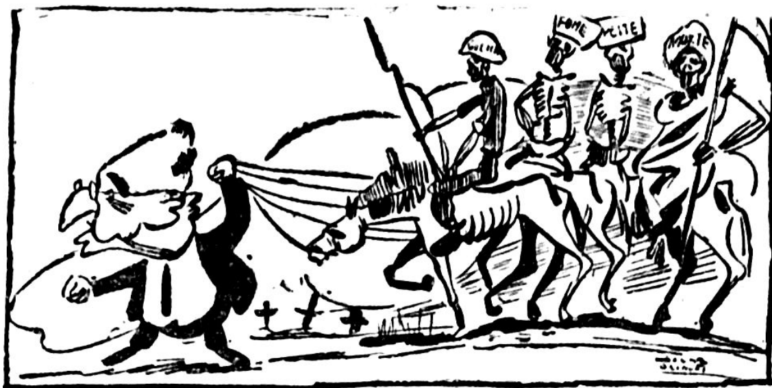
Figure 6: "Workers' Voice" February 9, 1952, p.3.