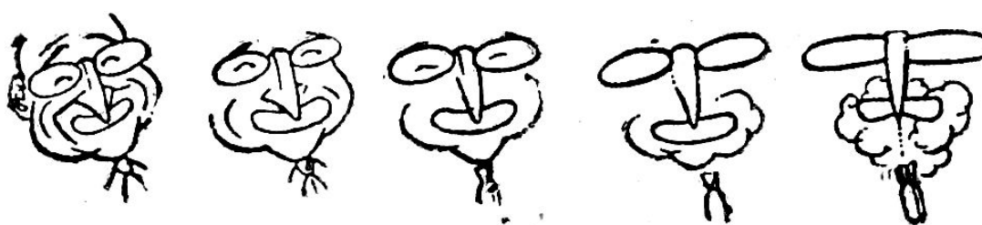
Figure 18: Workers' Voice April 26, 1952, p.5. Caption: From smile to the atomic bomb or the evolution of American aid

and the Vargas government action, the Manichean framework then appear as an expression of an alignment to a possible attack on the "peace camp" and its leader, the USSR. Vargas appears in many ways to complete this warlike appearance. The drawing published in Workers' Voice , of 26 April 1952 (Figure 18), attached matter denouncing military agreement between Vargas and Truman. The drawing shows the Vargas face being changed to become a plane dropping the atomic bomb, weapon used on Hiroshima and Nagasaki by Truman's order.