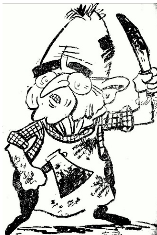
Figure 9: "Workers' Voice" November 21, 1953, p.6.

Even the buzzard has ascendancy over Getúlio, since it is the US imperialism, as shown in hat with stripes and stars. The report includes other central design, in which Getúlio Vargas acts as butcher, but does not kill cattle, but rather the population. The farmer of San Borja walks toward the reader, dirty blood and wielding a knife, an ax and wearing an apron. Instead of targets are animals that guarantee their richness, the readers, or employees, are. The aggression desire is evidenced in the hallucinated look Vargas (Figure 9).