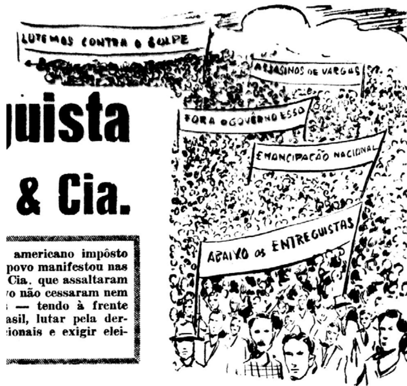
Figure 20: Workers' Voice September 4, 1954, p.10

Brigadeiro & Cia.", the design published in Workers' Voice, of 4 September 1954 (Figure 20) shows a crowd of Brazilians carrying banners with the words "let us fight against political coup ", down with the submissive "and" Vargas killers. " By design, the watchwords appear as a result of honest desires of the Brazilian people, which, here, are added to the claims of the PCB. Vargas suicide turns into murder, but the party quickly points the finger to the killers, and takes the focus off his campaign against Vargas. Prestes could admit privately the party's responsibility in Vargas suicide, but in communist drawings assassins were other and Labour, then, was an ally.