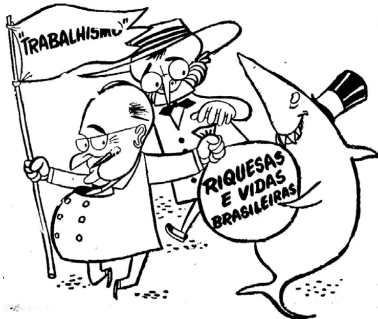
Figure 14: "Workers' Voice" February 9, 1952, p. 1.