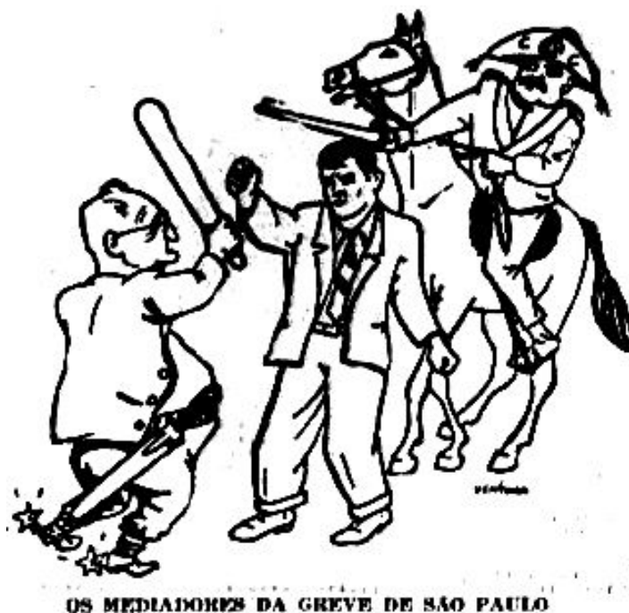
Figure 5: Workers' Voice 1. May 1953, p.2.

In “Workers' Voice”, the implied character above becomes clearer in a cartoon entitled “The Strike mediators in São Paulo”, published under an editorial on May 1, 1953 (Figure 5), during the strike of 300,000. On it, we see Vargas with spurs, sword and cudgel starting up worker, aided by a bandit on horseback. Here, there may be a subtle reference to regionalism, a union of retrogressive and well armed forces, represented by a “gaucho” and a typical Northeast figure, cowardly, for more, and the back, attack the working class of São Paulo, It has only his fists to defend himself.