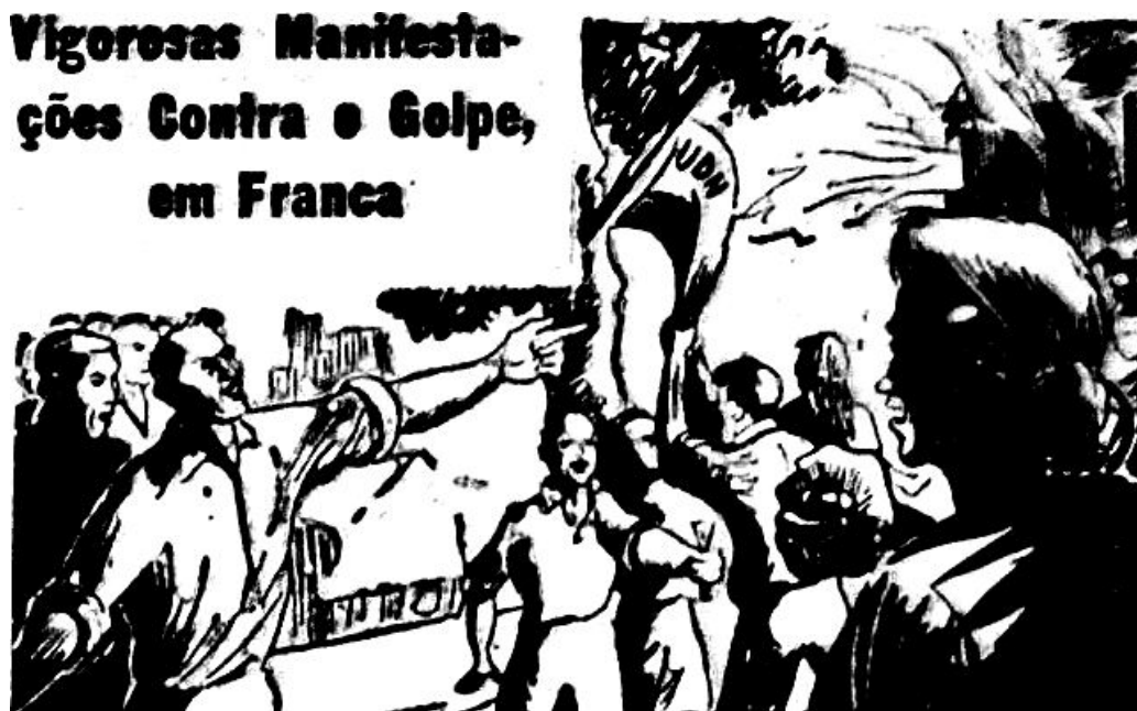
Figure 19: Workers' Voice September 11, 1954, p.7.

Vargas, the great rival of Luiz Carlos Prestes, criticized and ridiculed by the communist press passes after death, to be incorporated into popular outcries supported by the PCB. "Today's News", of September 26, 1954, published full-page article showing a haughty Prestes's face and the title "Communist and labor shoulder to shoulder in the fight against the common enemy." One possible reading of this image is that Prestes also suffered by the Brazilian people (though conveniently omits who contributed to part of their difficulties) and therefore labor must mourn the death of their leader acting from now with the Communists. Rodrigo Patto Sá Motta (2004, p. 105) describes the drawing in pen and ink as a "Prestes in heroic and manly position, looking forward steadily, with slightly disheveled hair, to suggest a man fighter and action." Popular Press, also from September 26, 1954, shows a handshake occupying the entire top of the newspaper, traditional image of who seals a commitment, and uses exactly the same headline of "Today News".