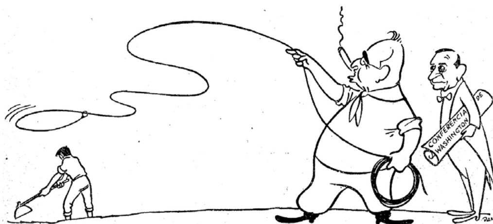
Figure 4: “Fundamentals” of July 20, 1951, p. 24.

The “Fundamentals” magazine of July 20, 1951 (Figure 4), publishes a design that follows the same line, but this time Vargas does not have a whip, but rather a rope used literally to lasso a farmer instead of cattle, which reveal the treatment of his employees and, by extension, all workers in the country. Probably, the goal would be to deny one of the great slogans of “father of the poor”: that government, since 1930, stopped treating social issue as a case of police, time in which the employee often was stuck in the loop, as well as the Getúlio’s charge was in his dominions in South.