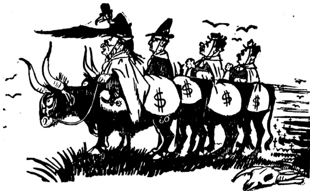
Figure 8: “Workers' Voice” November 21, 1953, p.7.

opposition to the “Knight of Hope”, riding a horse, showing the way to people, while Getúlio riding a passive and animal ready for slaughter, which symbolizes the accumulation of flesh, power and money (Canetti, 1995), both led by the imperialist vulture indicating the destination, where to feed their spoils. It is worth noting associations between money and food, obesity and power: in a way, the ox represents a continuation of Vargas' body, so great was his power, greed and money.