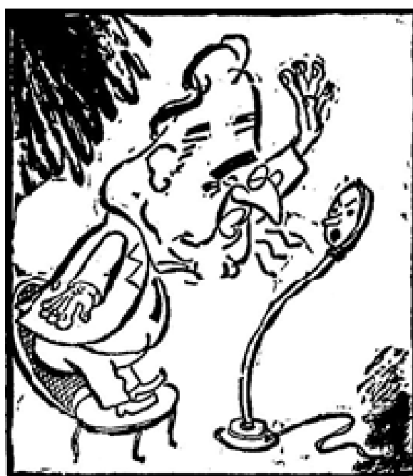
Figure 2: “Workers' Voice” September 2, 1950, p. 12.

The same “Workers' Voice” of September 2, 1950, on the last page (Figure 2) puts an old Vargas standing in the Senate Tribune chair talking ( "He said") in defense of the “New State”, compared to what " He did". His bad breath is a symbol of decadence and is away from the microphone. In the rest of the page, the paper lists the injustices of the regime. It is essential the "he said," because it refers to radio propaganda, both in the time of “New State” or as the tribune of the Senate, or to his speeches in various manifestations, a strong link with the crowd. When viewing an animated microphone, retreating before the cadaverous breath, the drawing shows how Getúlio’s message is rotted: it is the voice of the past, death. Not coincidentally, it appears a wrinkle and the reduction of its throat, which calls the reader's attention, showing the weakness of his message to the president close to get voiceless. The microphone is away, but for the party is the workers' mass metaphor moving away from the dictator. To complete the picture, it is a dwarf who needs to climb the chair to reach the microphone. In some variations, this “Varguista” representation appeared at various times.