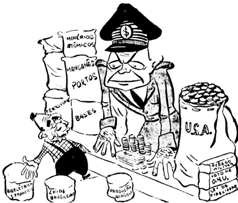
Figure 17: "Workers' Voice" July 3, 1954, p.7

Perhaps the clearest design in their meanings and implications be published in the Workers' Voice of 3 July 1954 (Figure 17), accompanying two-page report on the submission of the president trusts Yankees. The "negotiation" of President Vargas with Yankee imperialism does not occur with an employee any of the US government, but with a military bigger than Vargas. The products offered to the quite well stocked commander make up a significant number of the national economy. The military has several "products" that helped in the American war machine: as much money as the military agreement, to the international support to the vote at the United Nations (UN).