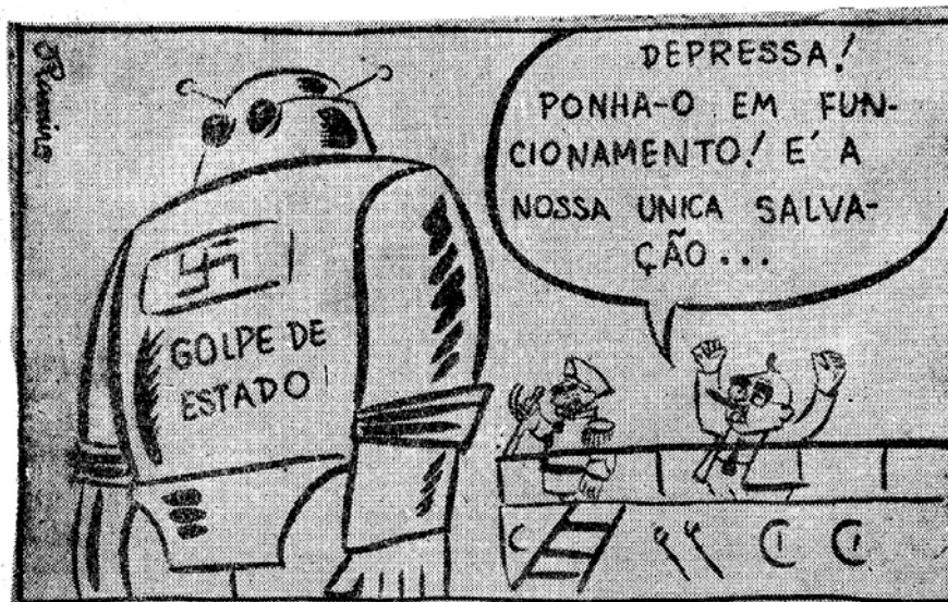
Figure 12: "Today's News" February 26, 1954, p.1.

Deconstructing Vargas's performance in the "New State" and his speech was critical to the party, given that the ideological construction of Vargas as "father of the poor" the approaching of urban workers, preferred target PCB. The Labour was a risk to the communists, because the PCB sought to identify as the only legitimate workers' party. Vargas advertising created after the founding of the PTB in 1943 was directed to the working masses, being a major rival to the PCB in the election dispute, union and symbolic.