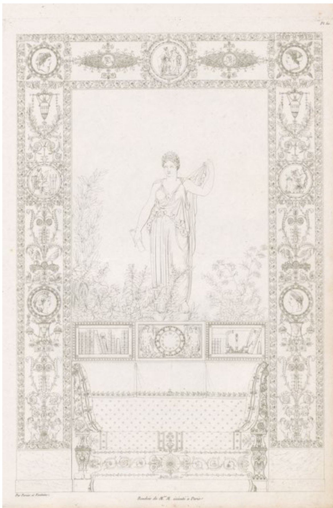
Fig. 2: PERCIER, Charles, FONTAINE, Pierre-François-Léonard. Recueil de décorations intérieures, comprenant tout ce qui a rapport à l'ameublement, comme vases, trépiéds, composé par Charles Percier et Pierre François Léonard Fontaine, exécuter sur leurs dessins. Paris: Didot l'ainé, 1812, plate 60. Ornamentation in Roman Pompeiian style.