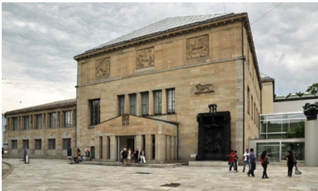
Fig. 7: Karl Moser: Kunsthaus Zurich , 1911.

The consequences of this questioning, however, could appear more clearly, and we hope that normative architecture found its closing stages with the ending of Modernism, not only in architecture, but also in architectural history. The merging of Art Deco (as architecture with ornament) and Modernism (as architecture without ornament) and the branching out of the latter as the Leitmotiv in the architecture of the second and third quarter of the 20th century requires further research.