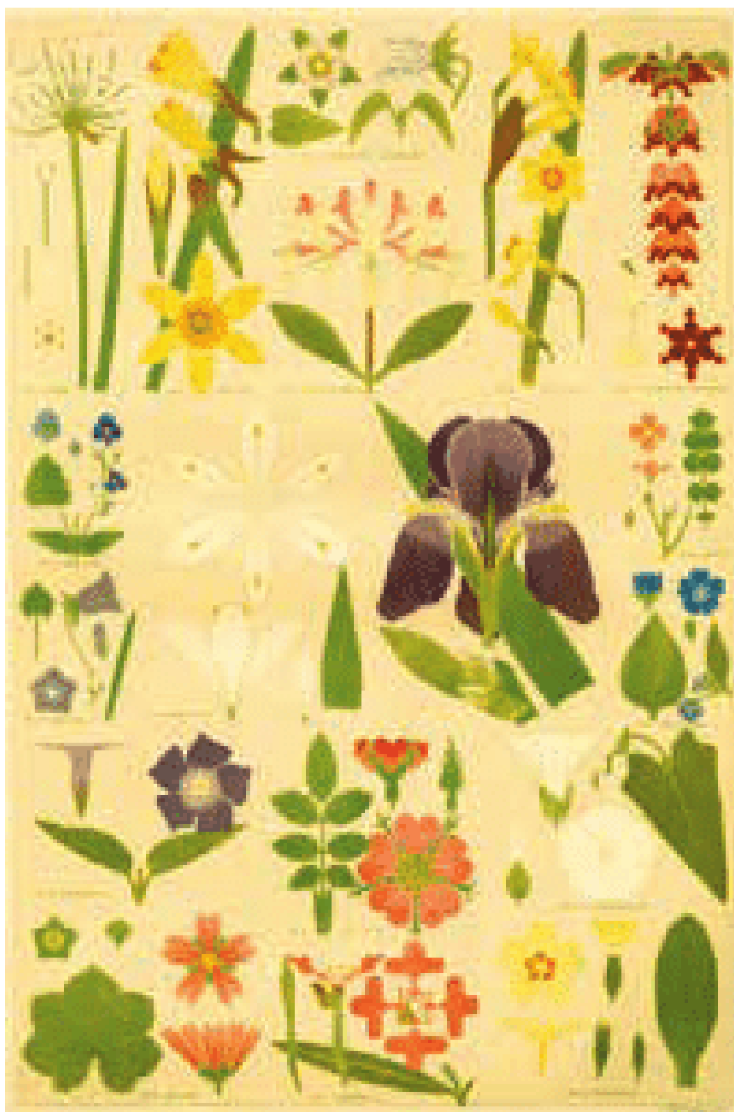
Fig. 4: Christopher Dresser: Leaves and flowers from nature. In: Owen Jones, Grammar of Ornament , London: Day, 1856, plate no. 8.

The next milestone in Dresser's study of Japanese art was his journey to Japan; he arrived in Japan in December 1876 and lived there for three months. During his stay, he compiled photographs, drawings, and objects, and Dresser published his book on