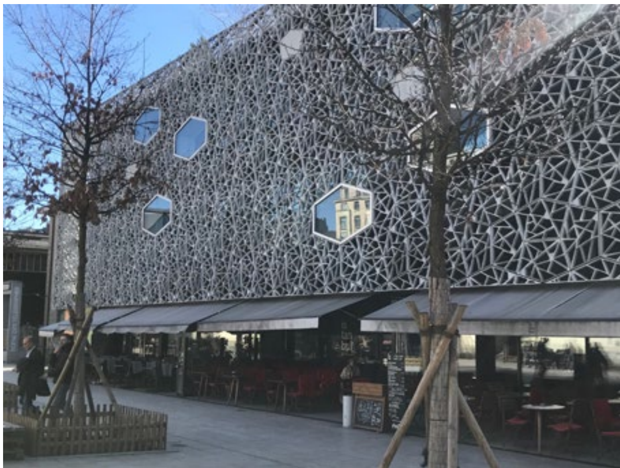
Fig. 9: Burckhardt + Partner SA: Les Pépinières (2014), Esplanade du Flon, Côtes-de-Montbenon 20, Lausanne.