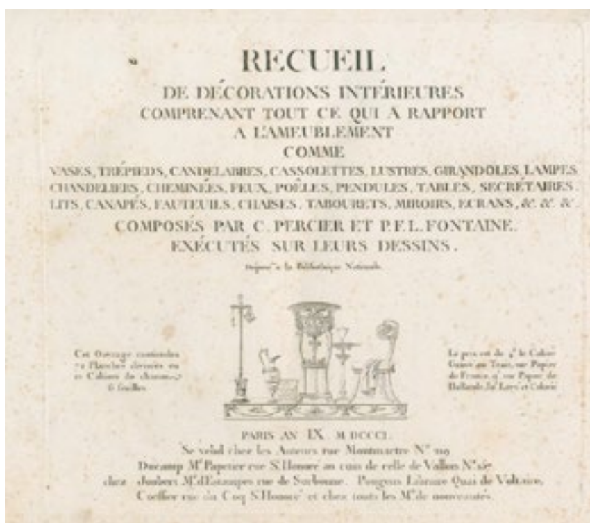
Fig. 1: PERCIER, Charles, FONTAINE, Pierre-François-Léonard. Title page of Recueil de décorations intérieures, comprenant tout ce qui à rapport à l'ameublement, comme vases, trépieds, composé par Charles Percier et Pierre François Léonard Fontaine, exécuter sur leurs dessins . Paris: Didot l'ainé, 1812.