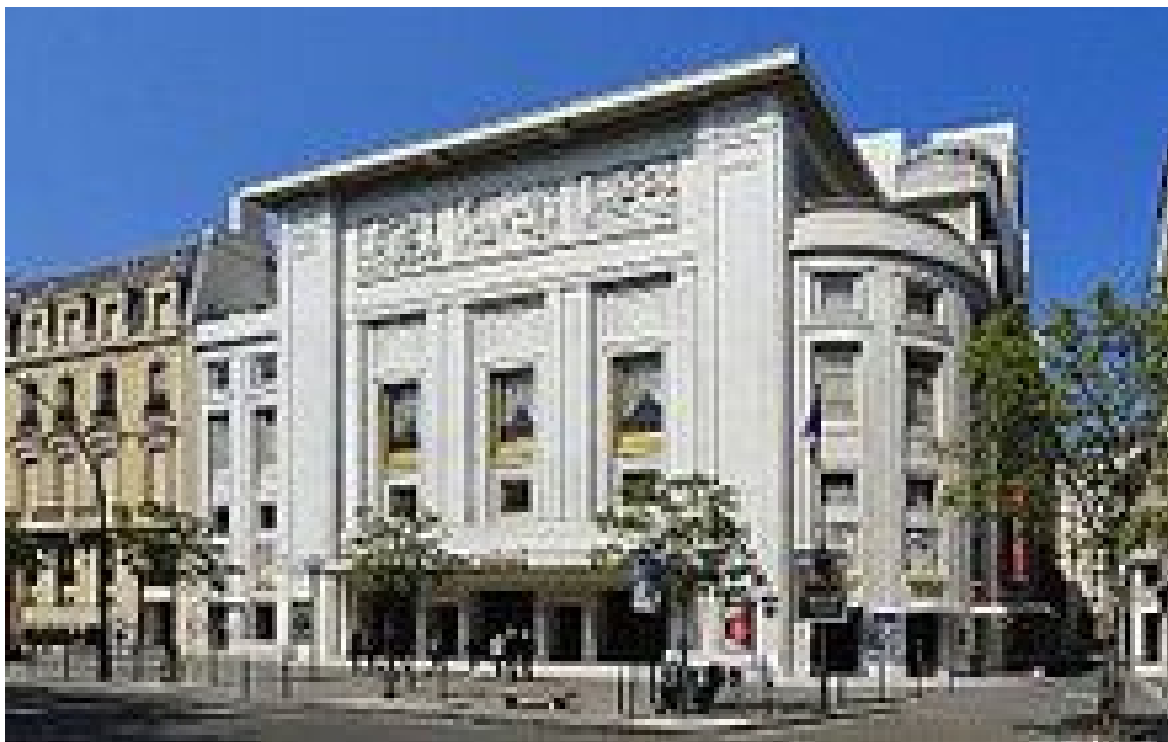
Fig. 6: August Perret: Théâtre des Champs-Élysées, 1911/1913.