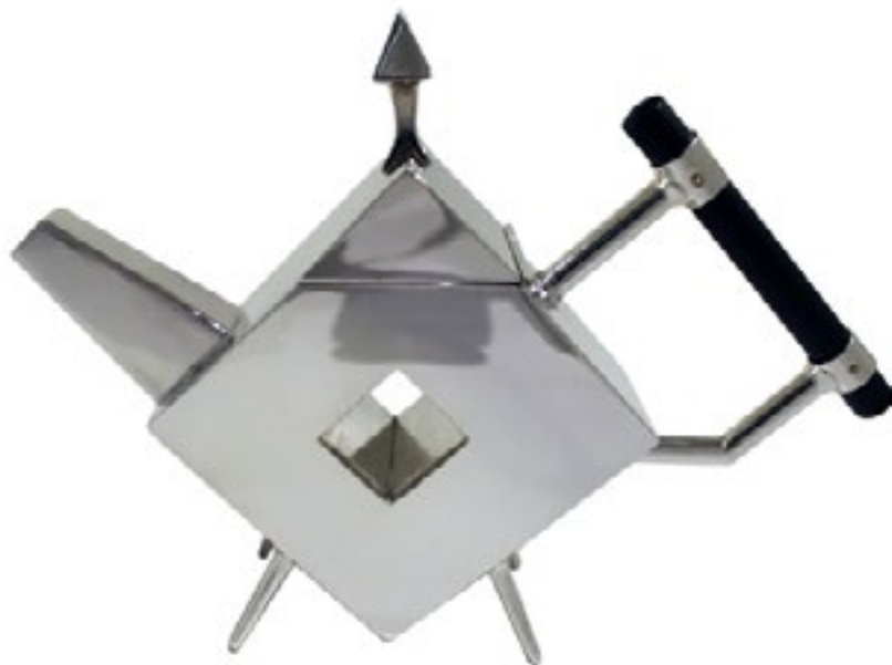
Fig. 5: Christopher Dresser: Teapot, 1879, Electroplated nickel silver with ebony handle, made by James Dixon and Sons, 1879. Victoria & Albert Museum, inv. no. M.4-2006.

Japan in 1883 17 , which resonated widely and was reviewed in the New York Times 18 . After his journey to Japan, Dresser's designs developed that pure form, without any ornament, which stuns us even today. Foremost in metalwork, he designed toast holders, teapots, and other objects for daily use without any ornament, displaying strong and clear forms, pretending a functionality that is, in reality, not always given (fig. 5).