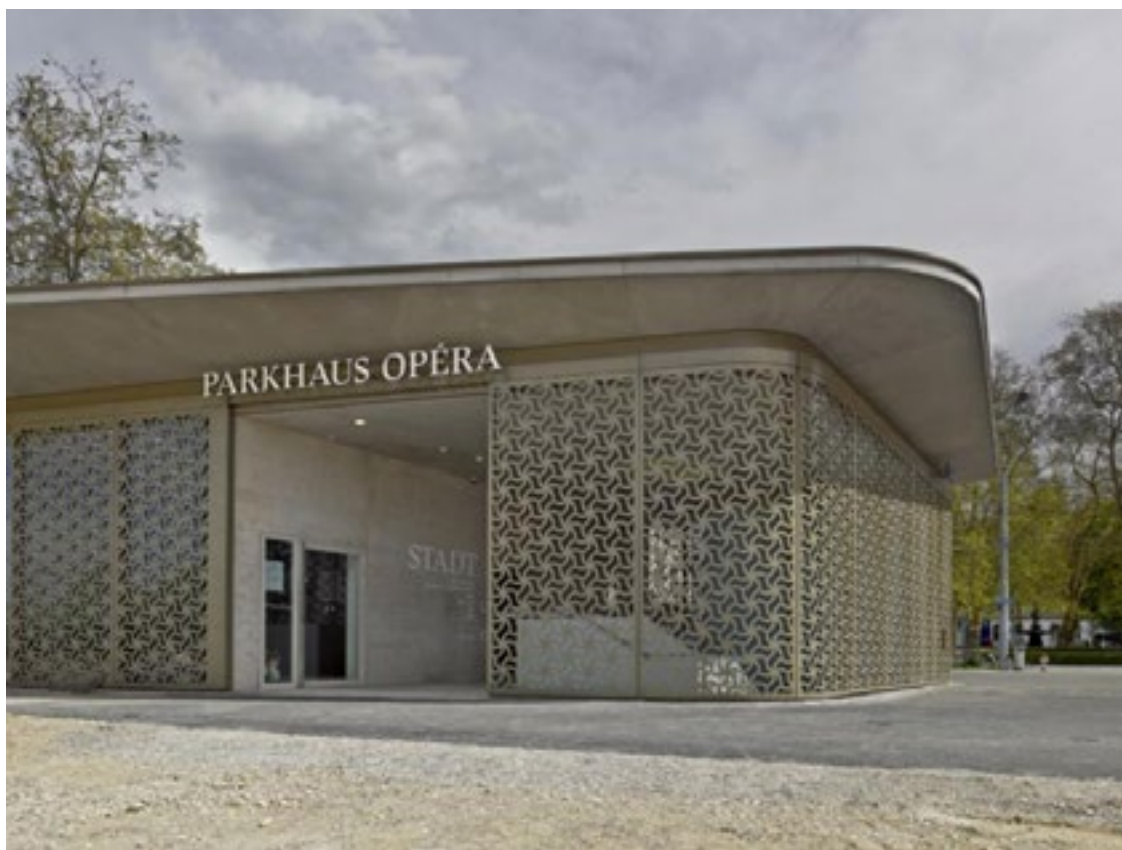
Fig. 8: Zach + Zünd Architects: Multi-story car park, Opéra in Zurich (2012).