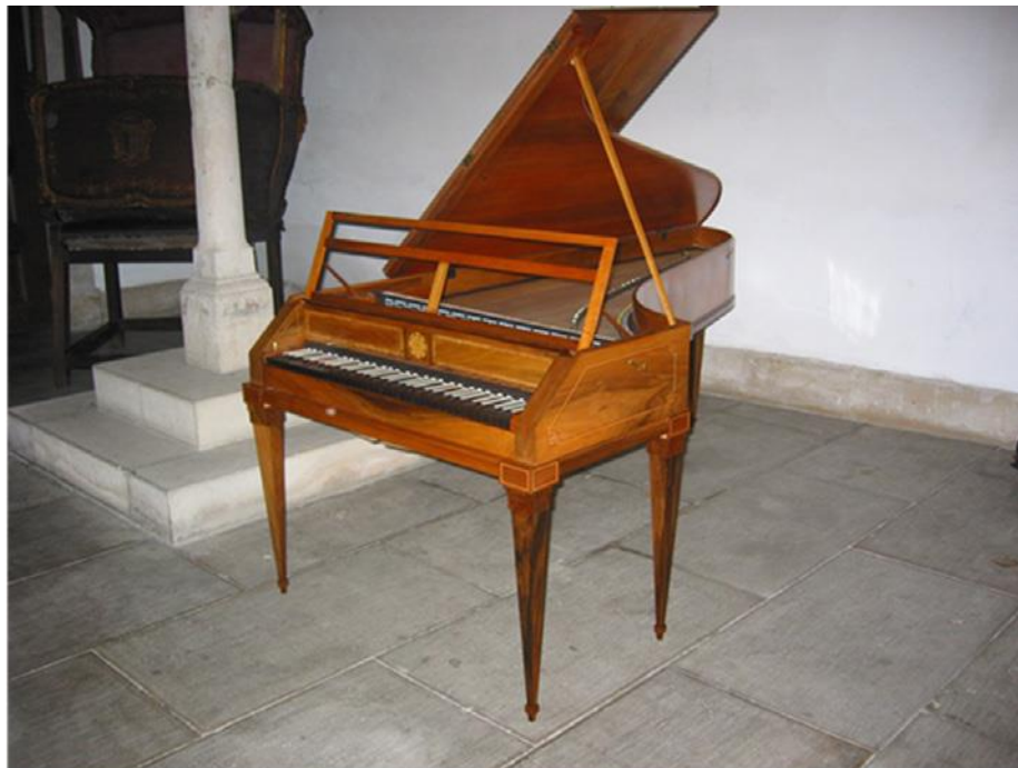
Figure 1. The fortepiano used in this project, built in 2002 by Paul McNulty.

The fortepiano used in this project is a copy made in 2002 by the American builder Paul McNulty, based on an 1805 Viennese model by Anton Walter, with five and a half octaves, and two knee-levers under the keyboard (Figure 1) 2 .