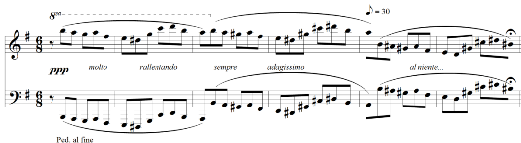
Example 6: Variation III – Ernst Widmer

The third and last variation (and miniature) closes the piece precisely with a process that represents a progressive separation from the original song. Each of the three evocations of it is more remote than the previous one. This third variation performs the role of finishing the narrative proposed by the piece, around its absent theme, already an expressive choice that accentuates the idea of loss and death. The choice of ' ppp ' and the use of these extreme regions of the keyboard immediately defines the intended mood. The ' rallentando molto ' and the confluence of the lines of unison to the center of the keyboard give the listener a direction, a sense of the inevitable. But what really gives the passage its tone is the proliferation of altered notes throughout the three enunciations, as a result of inversions of the original song: tonal inversion in the first; real inversion in the second, and a Phrygian transformation and inversion in the third, responsible for the presence of A-sharp. All of this makes the end, the last note, the most dramatic moment of the piece, with the pungent B-sharp. But, ironically, the distance established leads to a very familiar context: the notes D-sharp and B-sharp, that in the original melody represented the big leap of a diminished seventh, associated to the idea of "dying in the sea" (c – d#).