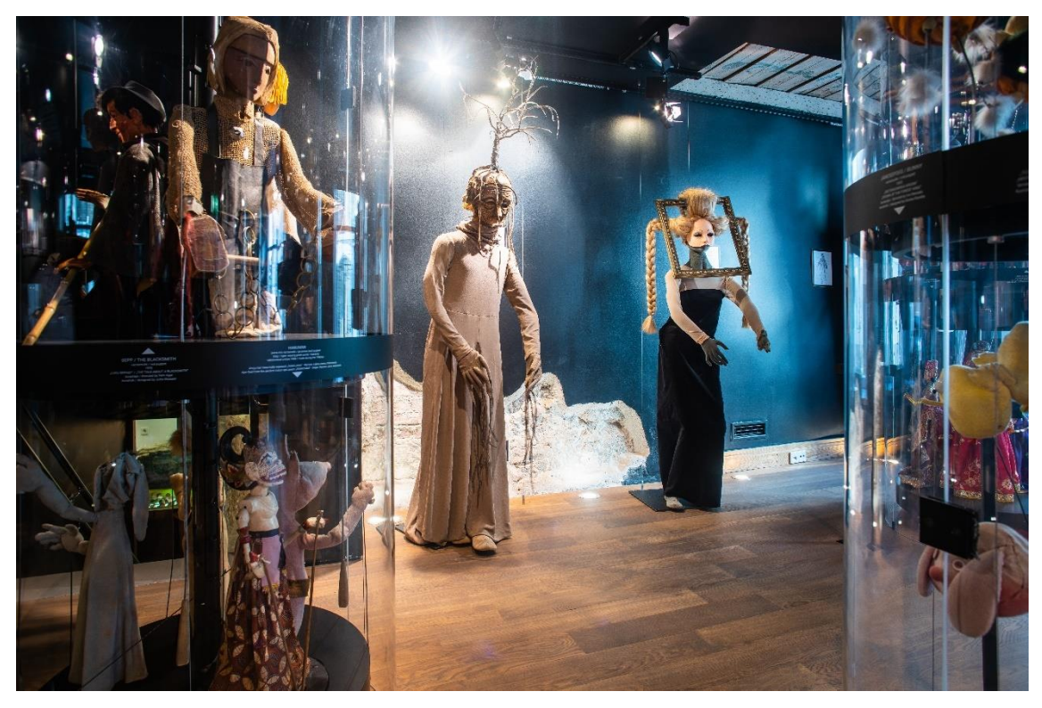
Figure 2 – Museum of Puppetry Arts in Estonian Theatre for Young Audiences was created out of a need and wish to find a place where to store and display puppets that had reached the end of their stage life. The goal of the museum is to introduce everything that is created and done in the theatre, and to provide inspiration for alternative teaching methods by introducing the method of puppet-thinking as a means of self-development.