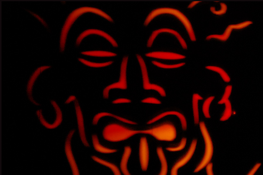
Buanga, a noiva da chuva - (2011). Companhia Karagozvk.