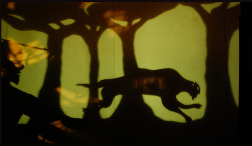
Buanga, a noiva da chuva - (2011). Companhia Karagozkw.