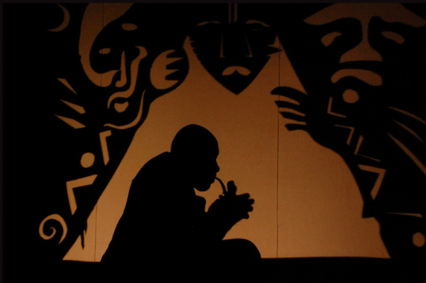
Buanga, a noiva da chuva - (2011). Companhia Karagozvk.