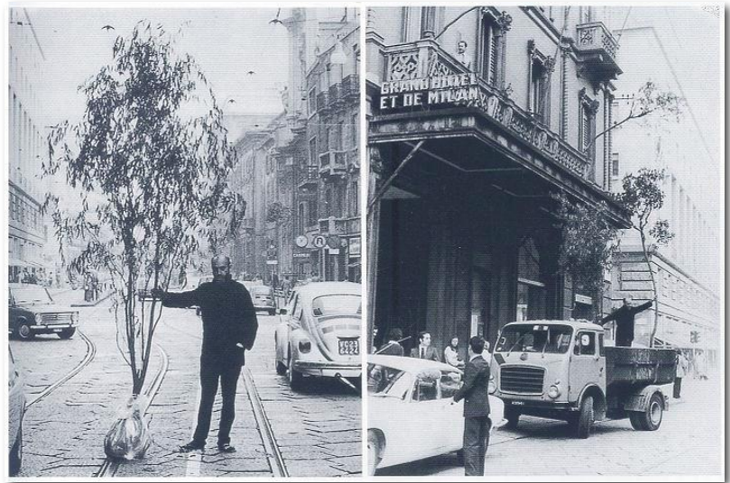
Figure 4. The tree-tenant project, Via Manzoni, Milan, 1973.