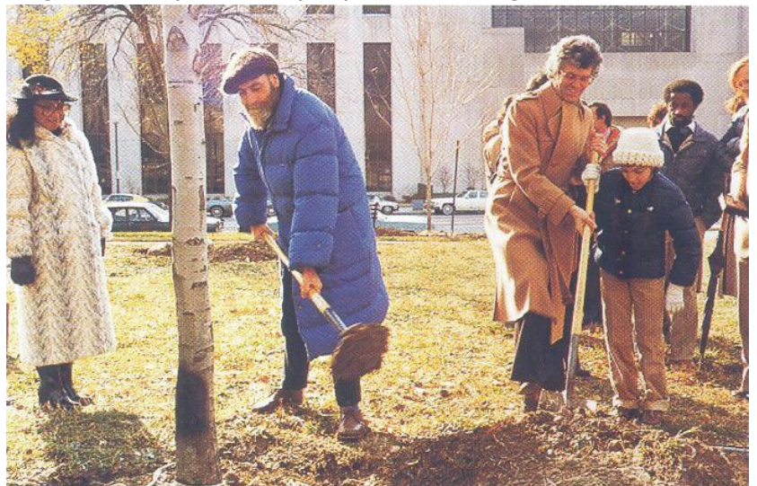
Figure 5. Tree Planting Ceremony, Judiciary Square, Washington, November 18.

The essential step of the eco-naturist house created by Hundertwasser has grass cover reinforced by the humus of the toilet and as the window-tenant trees. These plants store rainwater for use at home. Sewage purification is performed by filtration plants. Figure 5 highlights a ceremony held for planting trees.