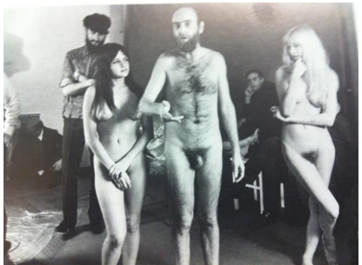
Figure 2. Hundertwasser during the bare speech against rationalism in architecture (1967).

Source: http://www.flutuante.wordpress.com