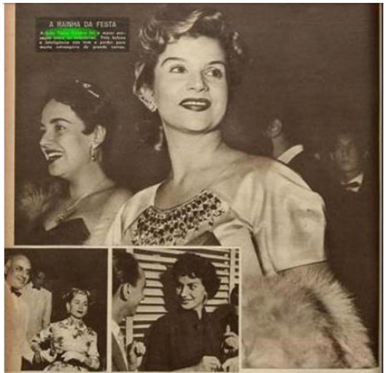
Figure 1: Tônia Carrero photographed at the International Film Festival of Brazil. O Cruzeiro , February 27, 1954, p.13.