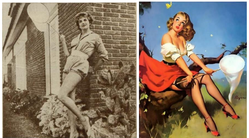
Figure 11. Pin-up by Gil Elvgren (1914-1980) hunting butterflies, 1956.

Source: Biblioteca Nacional . Available at: http://bndigital.bn.gov.br/hemeroteca-digital/ . Accessed on: 20 Jan. 2018.