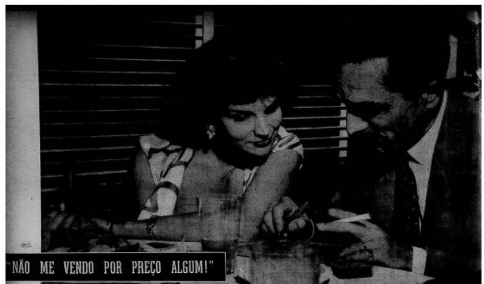
Figure 2. Tônia Carrero and Walter Pinto in proposal meeting for "teatro de revistas". "The answer was: no," Scena Muda , November 8, 1951, p.14