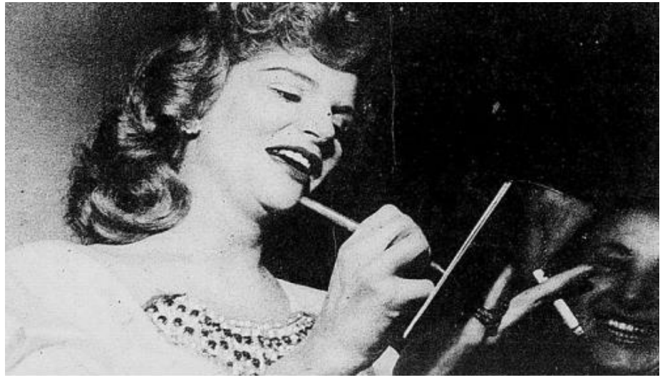
Figure 3. Tônia Carrero gives autographs at the International Film Festival of Brazil. "The Festival," Scena Muda , March 3, 1954, p. 12.

Source: Biblioteca Nacional Available at: http://bndigital.bn.gov.br/hemeroteca-digital/ . Accessed on: 22 Jan. 2020