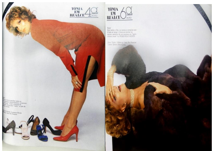
Figures 12, 13, 14 and 15: Tônia Carrero photographed in the editorial "Tônia at Enhancement".

In this edition, several photos of the actress were published, and even though at that moment the actress was already 58 years old, many images from the fashion editorial "Tonia at Enhancement" photographed by J.R. Duran referred to sensuality and glamour. In one of the photos, she appears holding a Hilton cigarette, her nails are red, and she is resting on a bench where a discreet cleavage occupies the center of the image. As in the early period photographs of her career, she looks at the viewer. In another photo, she appears lying down using (at least apparently) only a fur coat that falls to the side and lets you see one of her bare shoulders. Another sign of glamour that appears in most of her photos of the edition and in that image is very gorgeous jewels. In a third photo, the slanted pose highlights the hips and the red skirt with slits lets you see most of one of her thighs, which are prized using a scarpin heel. Even in an unusual and probably uncomfortable pose, the actress again faces the reader.