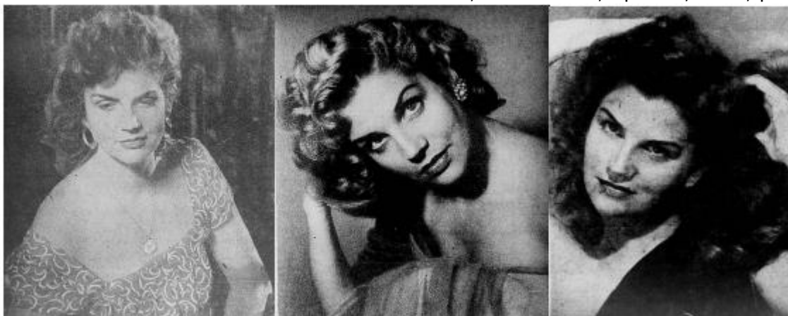
Figure 8. Tônia Carrero poses with her hands in her hair. "National Cinema presents its discovery: Tonia Carrero!", Scena Muda , April 22, 1947, p. 7