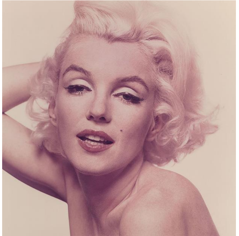
Figure 9. Marilyn Monroe in Bert Stern photography