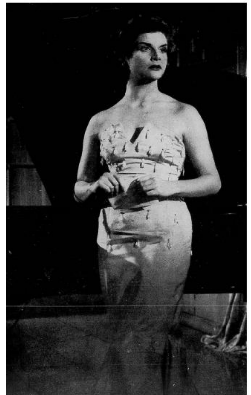
Figure 4. Tonia Carrero Apassionata's backstage. "Tonia Carrero," Scena Muda , July 17, 1952, p. 22.