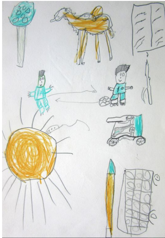
Fig. 08:- Children's drawing: narration about children's (experience) life: Imagination and Real-Thing Environment