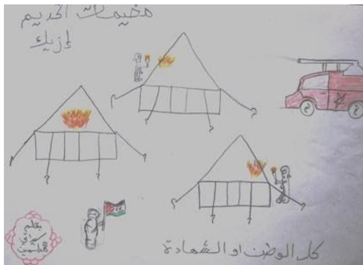
Fig. 06: Children's drawings: Extraordinary events in relation to persecution, flight © Rolf Laven

Here a drawing is recorded that tells about the expulsion and flight suffered generations before. The drawings are based on the families' past experiences.