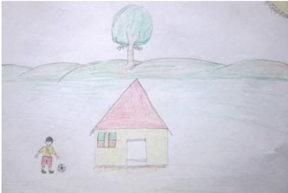
Fig. 07: Children's drawings depicting things that do not exist locally and in the actual experience of the people © Rolf Laven