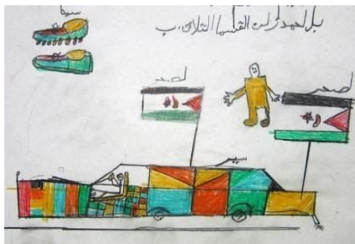
Fig. 05: Motifs such as the tent, flag, and car of a person in authority are depicted

As the author was able to experience for himself, the Saharawi flag is present at the morning roll call, before classes begin. The flags are an important part of the local experience. Other pictures show the palm of the hand, sometimes in the colours of the national flag.