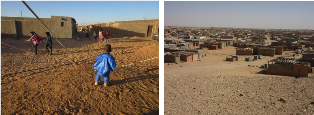
Fig. 01: Living situation in the camps of Smara, Feb. 2017