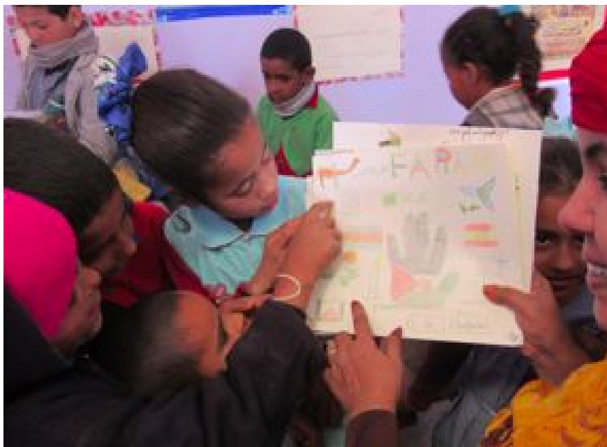
Fig. 03: Participants exchange information about the pictures they have taken. Appreciation of the children's pictorial work comes into play.

therefore the brightest area of the classroom. Religious and political motifs can be seen on the walls, as well as a map showing the original course of the border, rows of self-made, foiled drawings and illustrations of green parks and Baroque palace buildings.