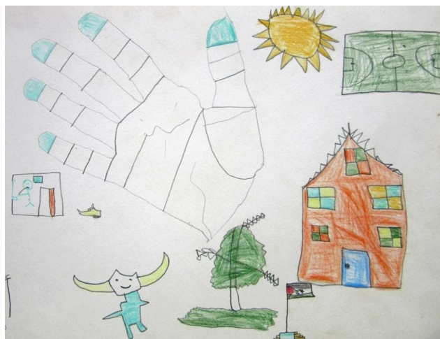
Fig. 09: Children's drawing: Imagined (house with pointed roof, green football field, tree) and real conditions (billy goat, house, tent, flag) are equally important in the picture © Rolf Laven