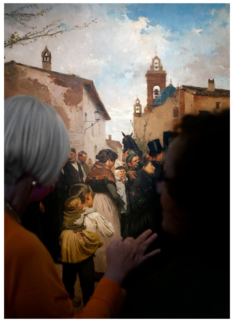
Fig. 5. People observing the painting The glory of the people (1895) by Antonio Fillol Granell, in the permanent exhibition of the Valencia Museum of Fine Arts.

and discoveries that tell us about social relations, how we observe the city, the way we live in it. In educational research, it is convenient to establish and connect with educational practices, since these same practices, based on ethnographic and artistic visual research, are articulated in turn in the double axis of research, teaching and the improvement of their own, integrating practices in their environment.