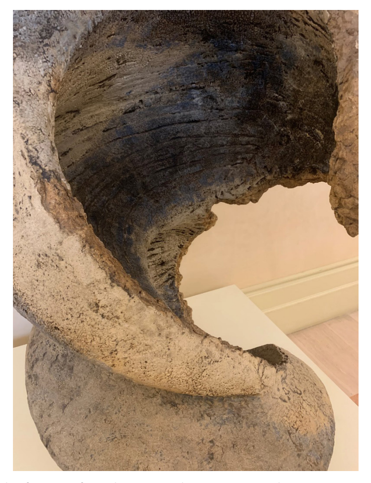
Fig. 2. Photograph of a piece from the Museu de Ceràmica. Author: María José Tamarit Moradillo.

The work develops an analysis of the value of the photographs taken during the drift, as a means to investigate the social environment from the lived experience (Sutton, 2020). It is investigated from an ethnographic, narrative and artistic perspective, involving all the research agents in the construction of an active story that is complemented and built in different phases: search, analysis and selection of images, discussion, analysis and joint reflection with the group (Ramon, 2021).