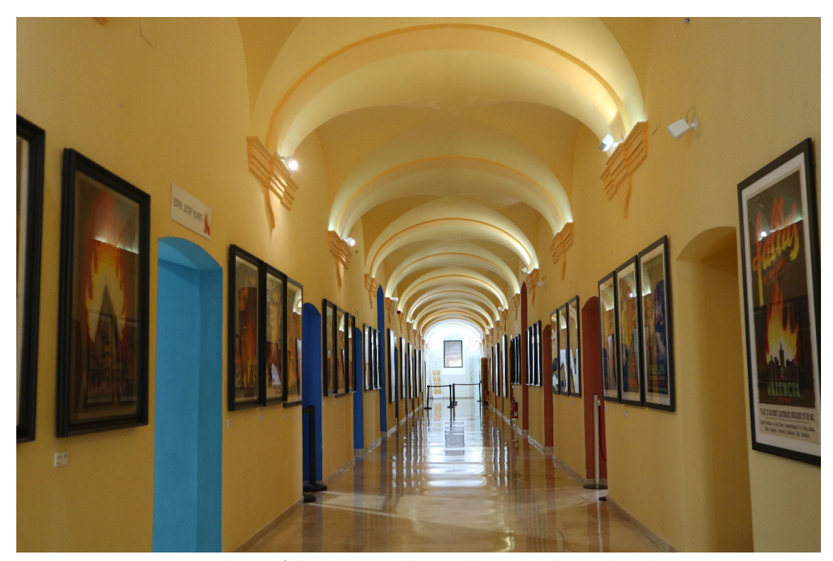
Fig. 1. Photo of the Museu Faller. Author: Arcadi Cotolí Melià.

The most intense and rewarding part of the process is choosing a single photograph, forcing students to question many aspects of their own creations (Barthes, 2009). The number of photographs uploaded (17 per museum) allows for an explanation in the classroom, with enough time to analyze each image, encouraging the teacher to generate debate among the students (Souza, Salgado, Chamon & Fazenda, 2022). It is from their images that we address formal issues, content, semiotics and symbologies. For example, in the case of the images of Arcadi Cotolí [figure 1], the importance of geometry in the creations of this mathematics teacher was commented. In addition, we take advantage of some element of each photograph to talk about artists who use photography as a means of expression.