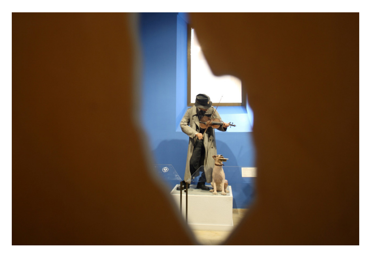
Fig. 3. Assembly of the room in the permanent exhibition of the Museu Faller. Author: Miguel Marin Jimenez.

Collecting photos that have been taken of the exhibitions set up in museums allows us to prepare detailed reports on the discussion processes, based on the analysis of the photographs presented by the students. It is convenient to influence this process as one of the keys of the investigation, since it generates a pedagogical practice in which the result is a conscious learning process, based on an auto-ethnographic visual story. The use of digital technology to take the images and share them with the group promotes an exchange of mutual knowledge (Haraway, 2019).