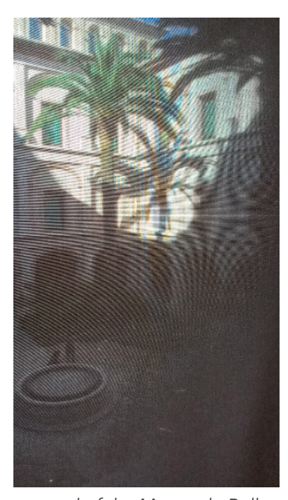
Fig. 7. View behind the blinds in a courtyard of the Museu de Belles Arts.

The great diversity of the museums visited also makes it possible to understand the potential of these institutions, since beyond their collections, their architecture, or the distinction that may emanate from the image they offer, what matters in this case is that the senior students enjoy, learn, and above all create, practicing an exercise in artistic production that empowers them as inspired designers [figure 7].