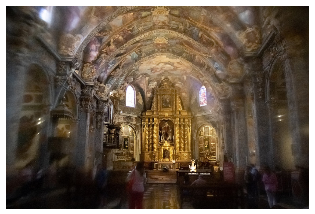
Fig. 8. Interior of the Church of San Nicolás, in Valencia.

and irrational, since it appeals to both feeling and intelligence. And is this aesthetic emotion useful? Echoing Plato's catharsis, based on the theories outlined by Aristotle, the author demonstrates how, in these times of crisis that we are going through, beauty is a formidable antidote against fear, horror, anguish and death (Morin, 2016).