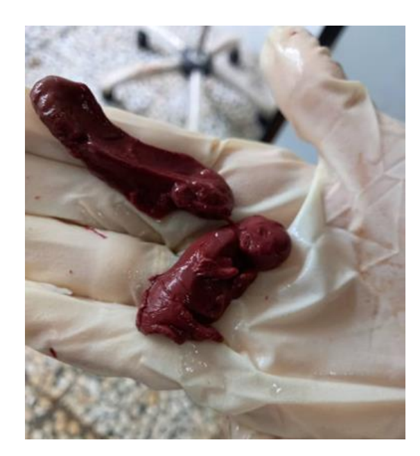
Figure 2. Mummified fetuses in queen No. 1

**Queen No. 6,11,12 and 13 received the second dose of hCG.