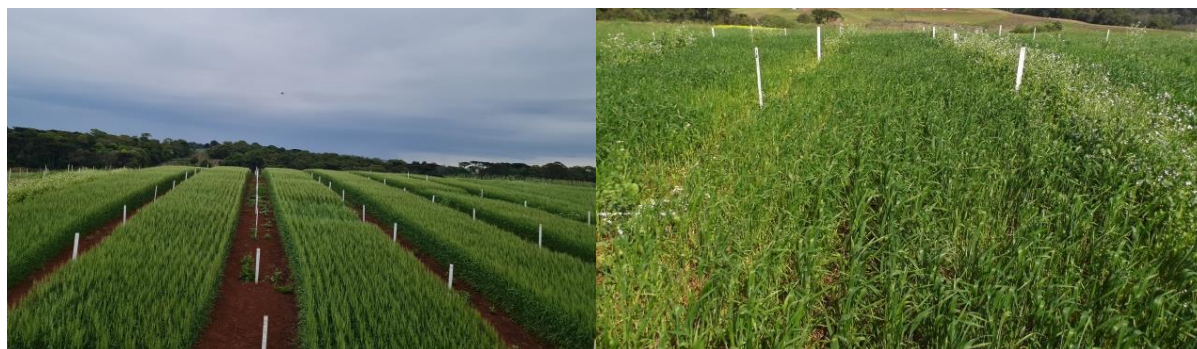
Figure 1. View of Experiment I (A) and Experiment II (B) at the beginning of wheat crop development. UFFS, Erechim/RS, 2018.

classified as Red Latosol Alumino ferric humic (SANTOS et al. 2018). Its pH correction and fertilization were performed according to the physicochemical analysis following the technical recommendations for wheat culture (CQFS-RS/SC 2016).