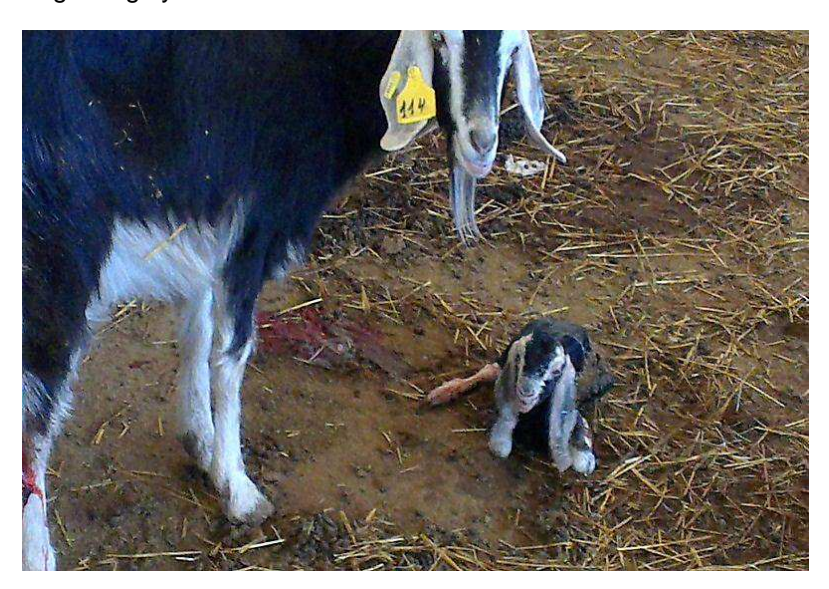
Figure 1. A doe from the flock just gave a birth.

The experiment involved 81 goat kids ( Capra hircus ) of the indigenous Arbia breed (Figure 1) raised in a high-input, zero-grazing system.