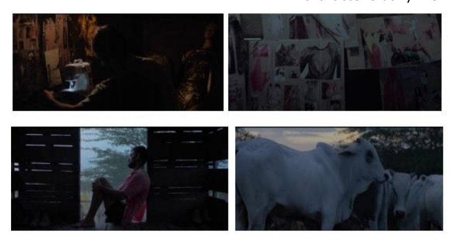
Figure 3 - 00:45:46 Sequence showing the contrast of the character's daily life.